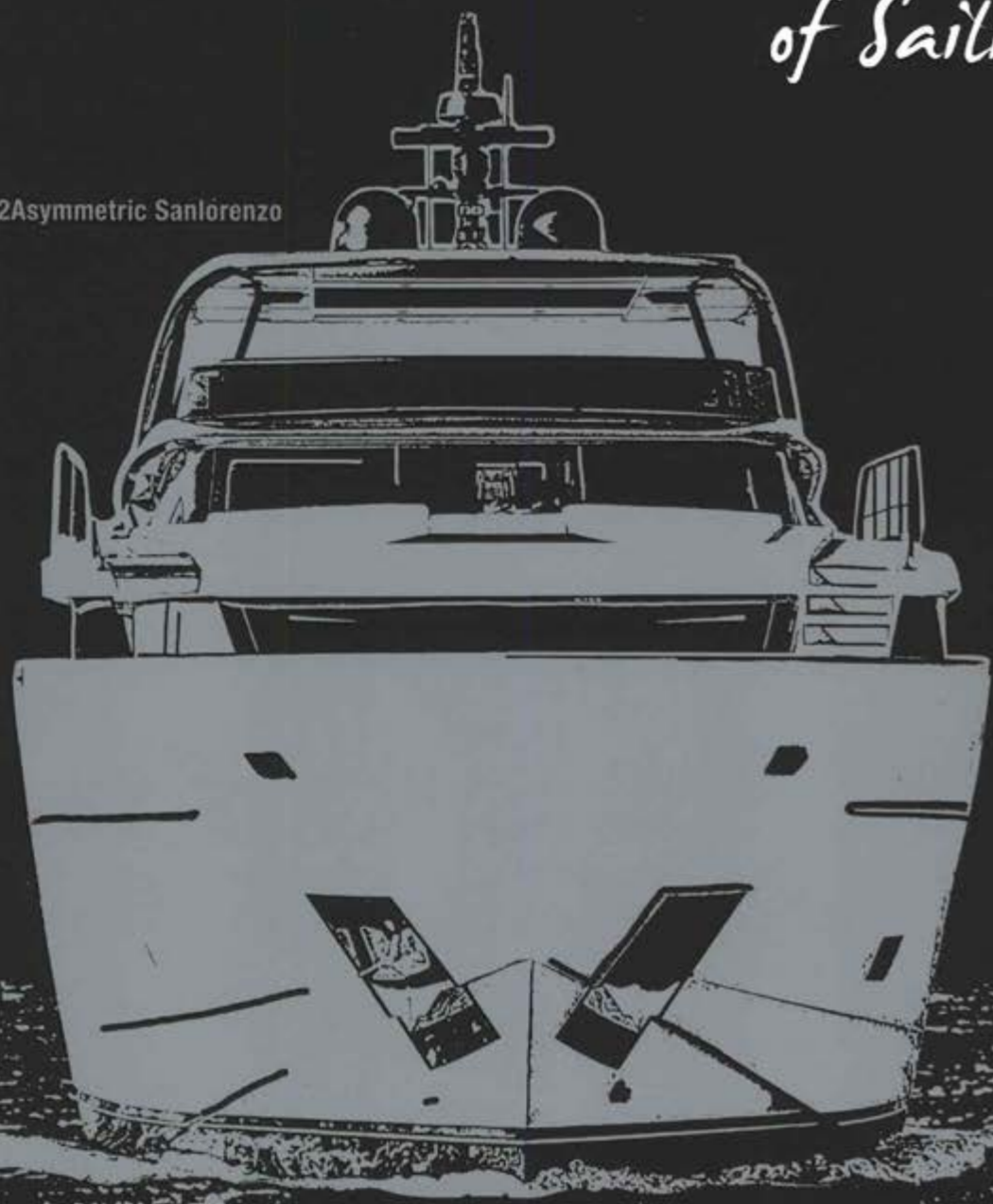
SL102 Asymmetric Sanlorenzo