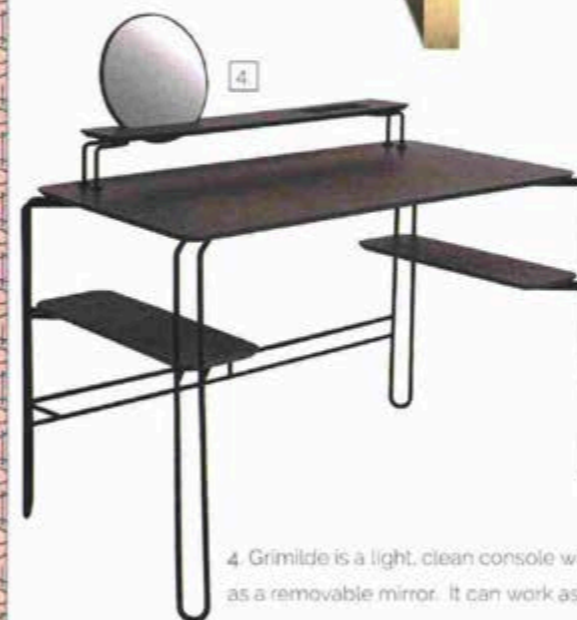
4. Grimilde is a light, clean console with a metal structure and lacquered wooden surfaces and various containers as well as a removable mirror. It can work as either a desk or a make-up table. The design is by Nicola Grisonda for Mentemano