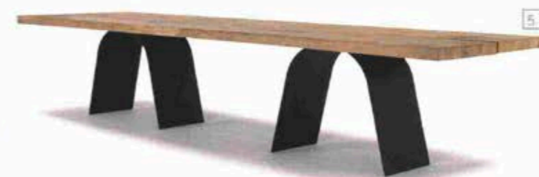
5. The Desco table by Amura has a wonderfully sculptural feel. Painted metal bases support a multi-layered surface in antique recycled oak veneer of between 80 and 350 years old