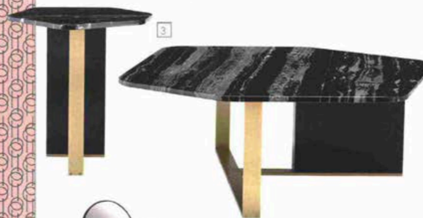
3. Almo is Daytona's take on a contemporary marble-topped occasional table. Its geometric lines create a sense of balance, while the surfaces showcase luxury materials and finishes, not least the Port Black marble top and satin-finish brass structure